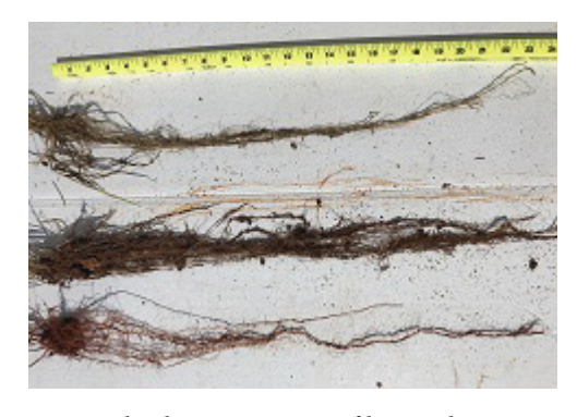
Figure 2. Root tube demonstrations of bermudagrass in a sandy soil, clay soil, and acidic soil ( pH \sim 5 ) show producers the importance of soil pH and texture on root systems. Typically, a sandy soil (top) will show a deep-rooted system with little branching, while the clay soil (center) is characterized by vertical roots and horizontal branching. The acid soil (bottom) demonstrated how poor soil pH can stunt both root and foliar growth because of limited nutrients.

The effects of soil pH were shown with bermudagrass grown in root tubes (Figure 2). In a highly acidic soil, plant growth can be stunted due to limited nutrient availability, leading to shorter roots with fewer root hairs for nutrient uptake.