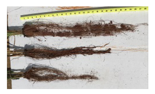
Figure 3. Grazing interval root tubes demonstrate the importance of rotational grazing and pasture rest for pearl millet root development. Management ranges from a 2-day cutting interval, representing overgrazed pastures (bottom) with short, stunted roots and little forage top growth to a well-rested, 21-day cutting interval (top) that show an extensive rooting system with root hairs and fungal mycelium. The 7-day cutting interval (center) represents a typical continuous management scenario.

Bio-management, however, does not just include the microbes. It also affects the way the forages and cattle are managed. Additional forage root tubes showed participants how their grazing management program might affect the forage resiliency in their pastures. Pearl millet and bermudagrass were grown in root tubes and then cut at 2, 7, and 21 days to simulate the improvements when forage crops are given more rest between grazings. When the tubes were opened, participants could see how the over-grazed plants were prevented from building deeper and larger roots. The short, stunted roots on the over-grazed plants contrasted with the roots of plants given proper rest. More rest resulted in a deeper, more-extensive root system with fine lateral roots and mycelia growth extending through the soil profile (Figure 3).