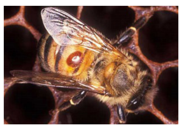
The Varroa mite (Varroa destructor) is an external parasitic mite of the honey bee, Apis mellifera. They are visible to the naked eye and look somewhat like a tick. Varroa mites are transported from colony to colony by drifting or robbing bees. Most infected colonies die within 1-2 years if not promptly treated for.

As for pesticides, the Jarrett's practice caution when setting up their hives on the road, as certain pesticides can be particularly harmful to bees, especially when people are not educated on proper pesticide application practices. Backyard beekeepers can educate their neighbors about the negative impacts misusing pesticides has on bee and other pollinator species, and can promote sustainable landscape practices that help attract bees and other pollinators to their yards and gardens. Slade warned that the biggest threat to bee populations is the varroa mite, and without proper control of the parasitic mite, both backyard and commercial beekeepers will surely lose their hives.