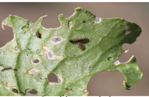
Larval damage on leaf

Brassicas are the primary hosts, with the beetle preferring plants with thin leaves (e.g., turnips, radish, arugula, mustards) over those with thick leaves (e.g., cabbage, broccoli, collards). Adults and larvae damage mostly leaves, chewing holes in the leaf margins and interiors. Leaf damage can be extensive. However, when foliage is depleted, larvae can move down to the ground to feed on exposed tubers of turnips and radishes.