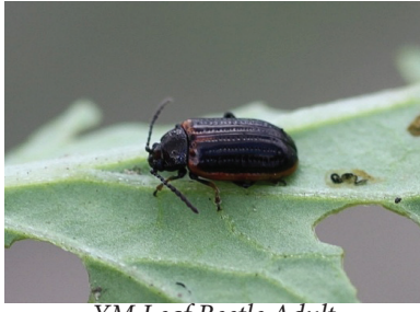
YM Leaf Beetle Adult

Adults: Adults are 4-6 mm long (males typically being somewhat smaller than females), and are dark bronze to black. The common name of the beetle derives from the color along the edge of the hard wing covers (termed "elytra") on the abdomen of the beetle. The margins are typically yellow, but also may be brown or clay red (as in the image). The length of the elytra is also striated with longitudinal rows of punctures, with four rows on each elytral side.