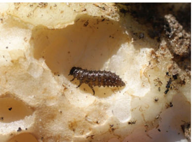
YM Leaf Beetle Larvae

Larvae: Larvae tend to be brownish-grey to charcoal, are slug-like in appearance, but have three distinct pairs of legs and have hairs on the body. The insect passes through three larval stages (called "instars"), and are most easily detected in the later 2nd and 3rd instars when they are larger and cause significant damage.