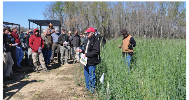
Workshop attendees look at cover crop demonstration plots.

this year's highlights included: peanut production in conservation production systems, cover crop selection and varieties, crop rotation study, herbicides for managing cover crops, cover crop planting ideas and planting equipment demonstration.