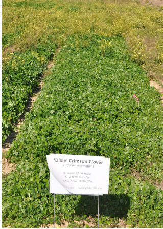
'Dixie' crimson clover was compared to earlier flowering varieties like 'AU Robin' and 'AU Sunrise'. All varieties were planted October 19, 2017 at 20 lbs/ac.

was present to discuss various herbicide options for use in cover crop management. He discussed the importance of proper herbicide selection based on the up-coming cash crop to be planted.