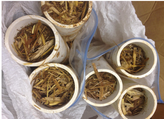
Figure 2. Soil cores to measure nitrogen release on-farm.

An on-farm study highlights both the variation in materials and the effects of weather on nitrogen availability. For the summer tomato season, the farmer chose to apply feather meal at a rate of 50 lbs of N per acre. As shown in Figure 3, the feather meal rapidly released plant available nitrogen, where 100% of the total nitrogen applied from the feather meal was available within the first 2 weeks. In contrast, the fall application of layer pellet fertilizer for broccoli (Figure 4), showed a slower release, where only 50% of the total nitrogen applied was available after 6 weeks of application. This illustrates that both material selection and weather played a large role in the nitrogen availability for these studies.