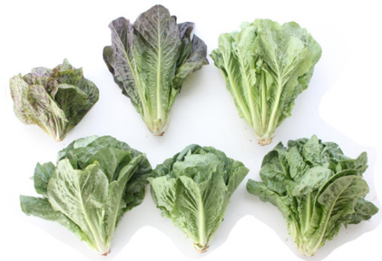
Fig. 1. Romaine cultivars. Top row: 'Freckles', 'Red Rosie' and 'Super Jericho'. Bottom row: 'Green Forest', 'Coastal Star' and 'Salvius' (left to right).

tunnels compared to the field in 2016 but not in 2015. This indicates that the high tunnel advantage may depend on yearly weather conditions. High tunnel lettuce was harvested 2 to 7 days earlier than the field and later planting dates were quicker to mature than earlier dates. The butterhead cultivar 'Sylvesta' and the romaine cultivar 'Green Forest' performed the best in both the high tunnel and field systems. In addition, the butterheads 'Adriana', 'Mirlo' and 'Skyphos' along with the romaine 'Salvius' performed well.