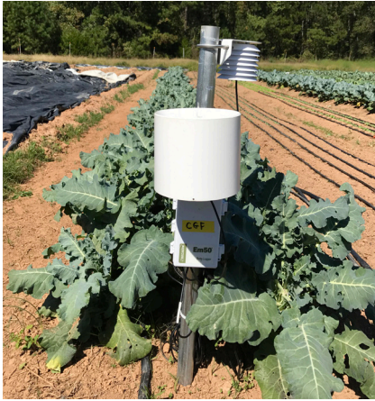
Figure 1. On-farm field study and weather station.

release. This on-going project includes laboratory studies, field studies at the UGA Durham Horticulture Farm, and on-farm studies with four collaborating farms.