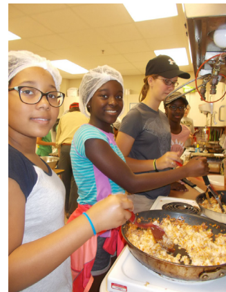
Students cooking with produce from the school garden.

garden to replenish nutrients. Our study of this robust FTS program demonstrated several main social and educational outcomes. In terms of educational outcomes, the FTS program created a collaborative learning environment that redefines school success to be more collective rather than individual-based. Furthermore, at the end of the school-year, students demonstrated increased understanding in the structural causes of food insecurity, such as cost and access, and a knowledge of environmentally sustainable farming practices. For social outcomes, students expressed they experienced an increased ability in the FTS program to form personal relationships despite differences. In the cafeteria, students and staff took collective responsibility for waste reduction.