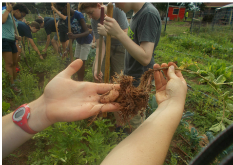
Students harvesting potatoes from the HMS garden.