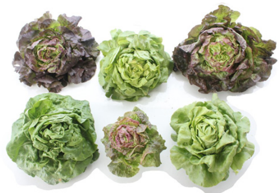
Fig. 2. Butterhead cultivars. Top row: 'Skyphos', 'Mirlo' and 'Red Cross'. Bottom row: 'Adriana', 'Pirat' and 'Sylvesta' (left to right).

The high tunnel system prevented air temperatures from dropping below 32^{\circ}\text{F} freezing (i.e., 6 to 9^{\circ}\text{F} greater in high tunnels) and resulted in an additional 1 to 2^{\circ}\text{F} heat gain on the hottest days. The 2015 spring was much wetter (50% more rain!) and slightly cooler than 2016. The high tunnel plants had less leaf wetness but the conditions were still