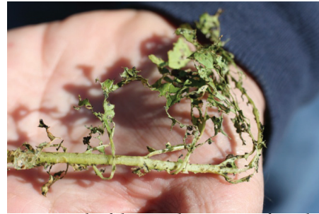
Extensive leaf damage by Y.M. Leaf Beetle

Larvae: Larvae tend to be brownish-grey to charcoal, are slug-like in appearance, but have three distinct pairs of legs and have hairs on the body. The insect passes through three larval stages (called "instars"), and are most easily detected in the later 2nd and 3rd instars when they are larger and cause significant damage.