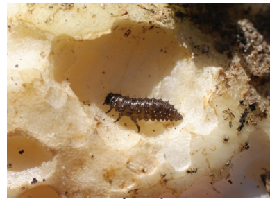
YM Leaf Beetle Larvae

Larvae: Larvae tend to be brownish-grey to charcoal, are slug-like in appearance, but have three distinct pairs of legs and have hairs on the body. The insect passes through three larval stages (called "instars"), and are most easily detected in the later 2nd and 3rd instars when they are larger and cause significant damage.