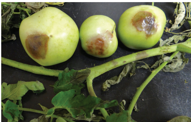
Tomatoes infected with late blight

Late blight is a “water mold” and spreads rapidly in mild, wet weather where it can kill entire plants in a few days. The disease will often cease to spread in hot, dry weather. The symptoms of late blight are somewhat unique compared to other foliar tomato diseases such as early blight or bacterial spot. Instead of discrete leaf spots, the leaves look “blighted” with dark, limp, irregular shaped blotches, often starting from the edge. Dark brown lesions also appear on the petioles, stems, and fruit. (see image below of sample received in the clinic). When conditions are humid, white sporulation can be observed on the undersides of the leaves and on stem lesions.