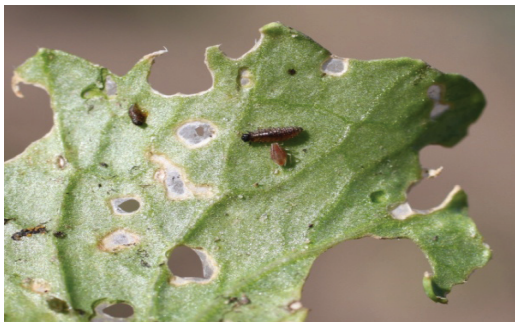
Larval damage on leaf

Brassicas are the primary hosts, with the beetle preferring plants with thin leaves (e.g., turnips, radish, arugula, mustards) over those with thick leaves (e.g., cabbage, broccoli, collards). Adults and larvae damage mostly leaves, chewing holes in the leaf margins and interiors. Leaf damage can be extensive. However, when foliage is depleted, larvae can move down to the ground to feed on exposed tubers of turnips and radishes.