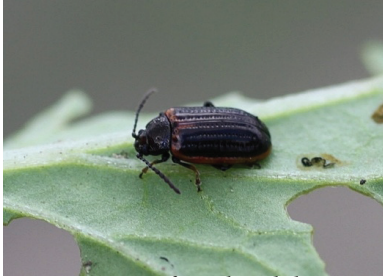
YM Leaf Beetle Adult

Adults: Adults are 4-6 mm long (males typically being somewhat smaller than females), and are dark bronze to black. The common name of the beetle derives from the color along the edge of the hard wing covers (termed “elytra”) on the abdomen of the beetle. The margins are typically yellow, but also may be brown or clay red (as in the image). The length of the elytra is also striated with longitudinal rows of punctures, with four rows on each elytral side.