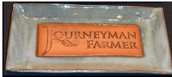
Journeyman Farmer pottery was awarded to the first cohort of Journeyman Farmers at GA Organics Conference.

The Journeyman program is expanding and growing from its pilot year. Year two locations include Carroll, DeKalb, Dougherty, and Screven counties. These counties are finishing trainings and the Hands-On program for these sites will begin this spring. While the pilot year involved 92 unique participants, Year 2 has attracted at least 230 people to its trainings.