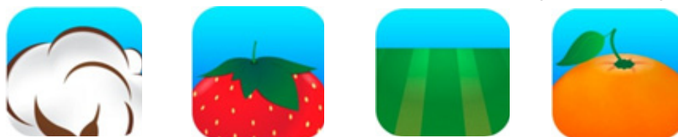
Figure 2: The Cotton App, Strawberry App, Turf App, and Citrus App reduced water use and maintained or improved yields, ( smartirrigationapps.org ).

Our results showed that irrigation scheduling with the Vegetable App could reduce water use and improve yields compared to the checkbook method. Soil moisture sensors also reduced water use; however, yields were also reduced for tomato and watermelon compared to yields obtained from the Vegetable App or the checkbook method. Internal fruit quality was not affected by irrigation scheduling regimes, but marketable fruit yields decreased when grown under the checkbook method. Based on our first season of data the Vegetable App improved profitability of tomato and watermelon production and reduced water use compared to the UGA checkbook method. The Vegetable App will continue to be evaluated and presents an option for alternative irrigation scheduling. If you are interested in giving it a try, check out the app at smartirrigationapps.org .