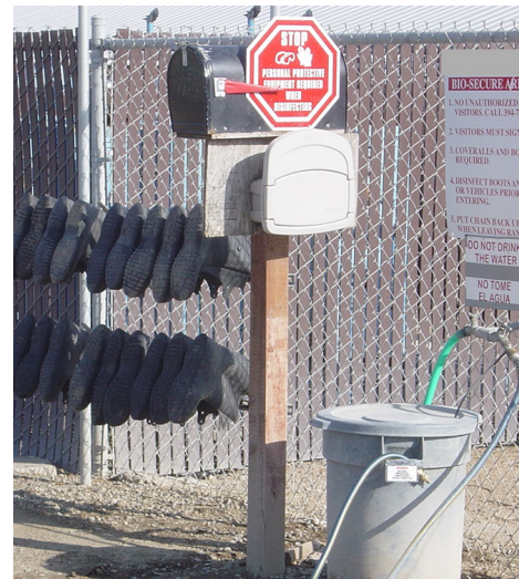
Properly managing foot traffic and introduction of new birds are a top priority.