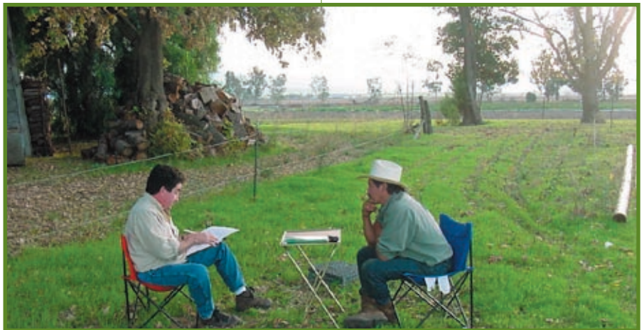
Interviews are important in order to understand the experience and knowledge base of prospective employees. Performance tests are another way to ensure that employees have the skills you're looking for.