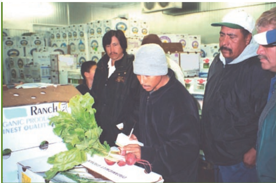
Employees can teach each other how the business works. In the process, everyone learns leadership, responsibility and cooperation.