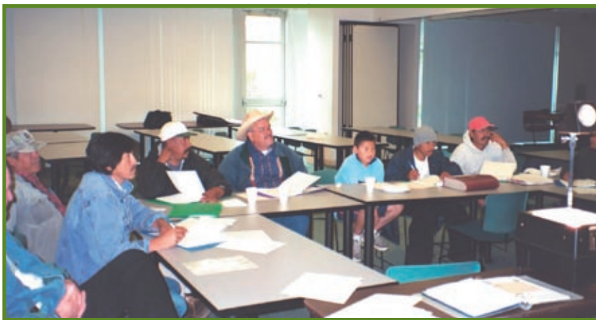
Monthly safety meetings reduce accidents and workers’ compensation costs.