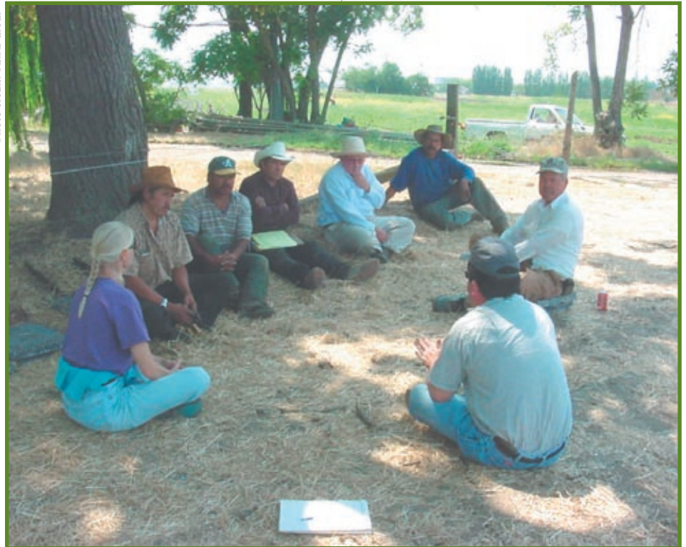
It's important to treat all employees with respect in every aspect of work.