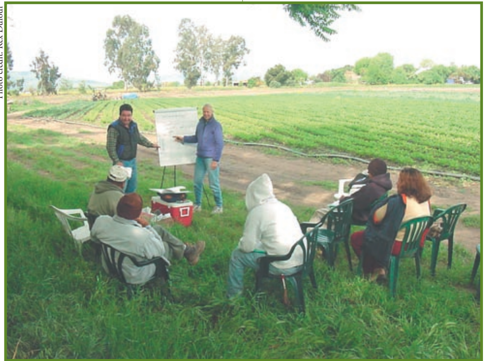
On-farm educational sessions can help employees understand how businesses operate or they can address some other common interest.