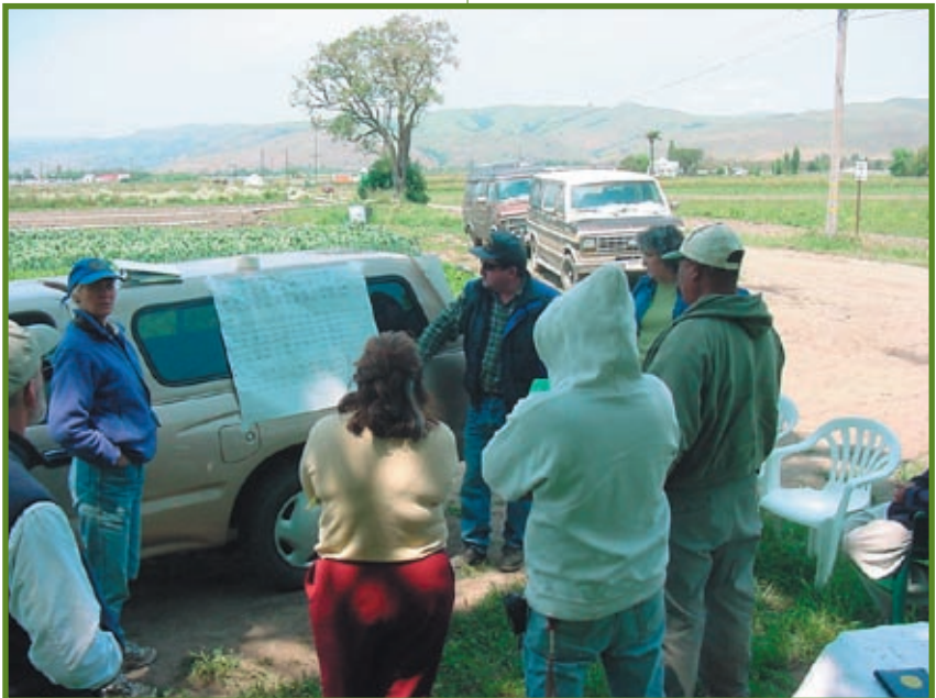
Regular staff meetings with employees provide a place to discuss production tasks, personnel conflicts, and safety concerns.